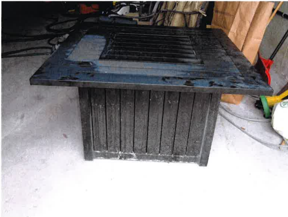
Wujiang Gaorui Garden Metalwork – WBT Series Fire Pit

Photographs of the subject fire pits and the horizontal cradle assembly are below: