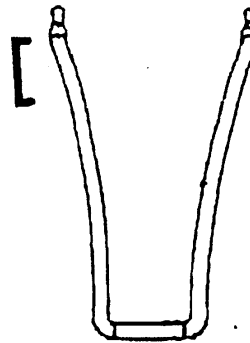
Pre 1993 (Restraint Requiring Inspection)