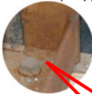
(two bolts per side panel)

Verification shall be performed by removing the fiberglass seat on each car. This will enable you to view the bolt closely to ensure proper sizing and grade as designed by the manufacturer.